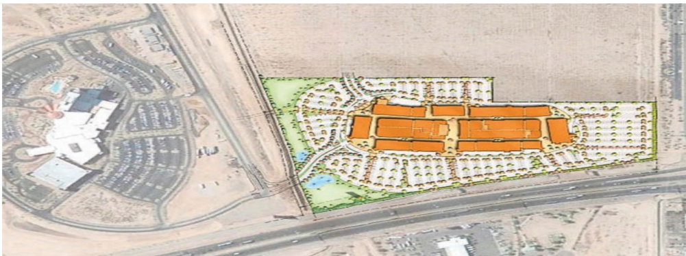
Submitted rendering Outlets

Be sure to check back here next month for the latest events happening in the Greater Tidewater, VA area.